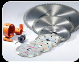
Power Tools Accessories