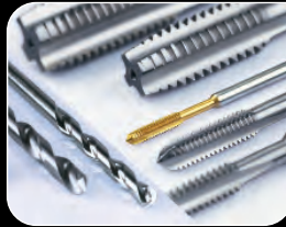
HSS Drills & Taps