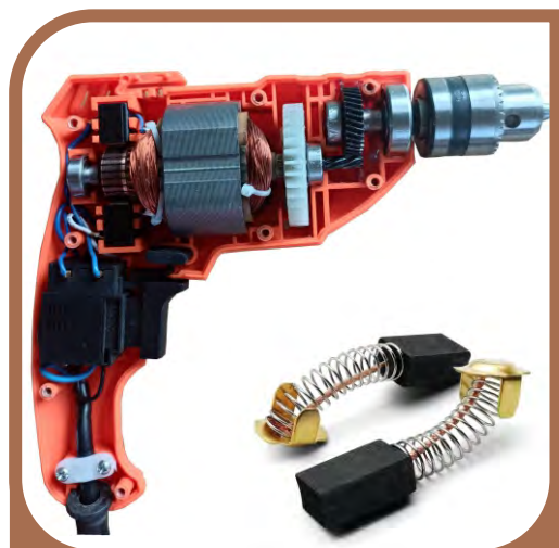
Power Tools - Spares