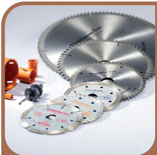
Power Tools Accessories